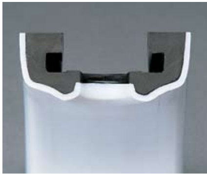
Seat cross-section at stem hole.

BRAY'S UNIQUE SEAT DESIGN is one of the valve's key elements. The elastomer backed PTFE seat features a tongue and groove retention method which holds securely between either slip-on or weld-neck flanges and also allows simple and fast field replacement. This EPDM backing provides resilient support for the molded PTFE, thus maximizing the shut-off and cycle life of the seat.